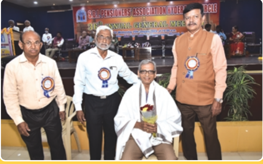
Shri P. Narasimha Rao