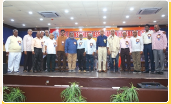
Office Bearers at Business Session