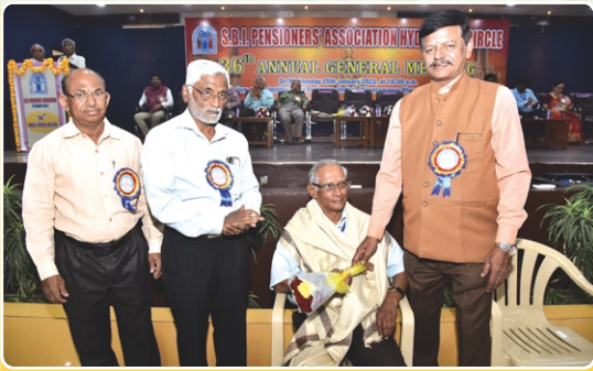
Shri D.V. Narasimham