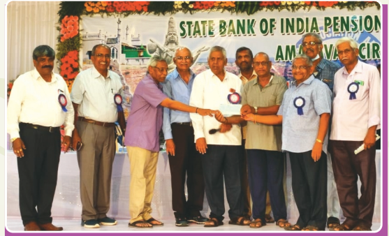
Donation of Rs.50,116/- to SBIPA Building Fund by Eluru Unit