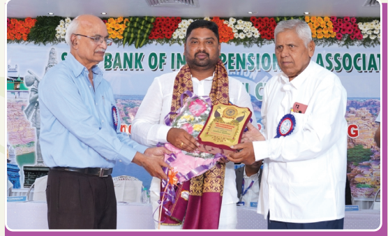
Representative of SEWA